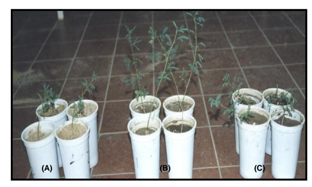
Figure (3): Growth of Acacia tortilis subsp. raddiana on different soil types: (A) Sand, (B) Loamy-sand, and (C) Sandy-loam.

Acacia tortilis seedlings showed very highly significant variation ( P \le 0.000 ) in growth parameters on different soil types (Table 5, Fig. 3). The highest growth was recorded for seedlings growing on loamysand soil at the four measurement times (two, four, six, and eight weeks). A. tortilis showed a relatively good growth in sandy soil even it is significantly lower than in other two soil types. Meanwhile, highly significant variation in terms of change in heights ( P \le 0.000 ) and number of compound leaves ( P \le 0.004 ) was recorded in all soil types. The highest mean of change in height (9.45±3.51 cm plant<sup>-1</sup>) and number of compound leaves (2.20±2.11) were recorded in loamy-sand soil by the eighth weeks of transplantation (Table 5). Tukey's test didn't recognize a significant difference between change in number of compound leaves of plants in sandy-loam and loamy-sand soil. This high growth of A. tortilis plants in loamy-sand soil was accompanied by higher survival percentage (94.3 %) than plants in sandy-loam soil (89 %). No difference was recorded in survival percentage among plants in sandy and loamy soils.