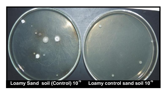
Figure (2): Effect of CS<sub>2</sub> emission from Acacia tortilis subsp. raddiana roots on actinomycetes population of loamy-sand soil.

different ( P \le 0.000 ). The variation was also significant between different soil types used and amount of CS_2 emitted, where loamy-sand soil was the highest at fourth weeks (9.0 X 10^6 g<sup>-1</sup> with 95.5% reduction) followed by sandy-loam after sixth weeks (8.50 X 10^6 g<sup>-1</sup> with 99.6% reduction) of transplanting.