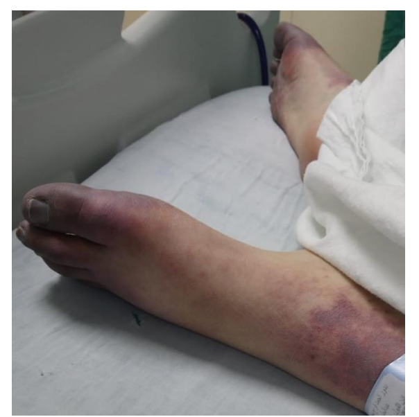
Figure 2. Vasculitic rash in an SLE patient with COVID-19