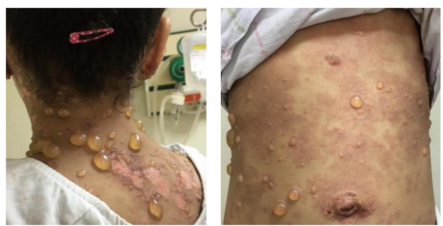
Figure 3. Bullous eruption in a newly diagnosed SLE patient with confirmed COVID-19