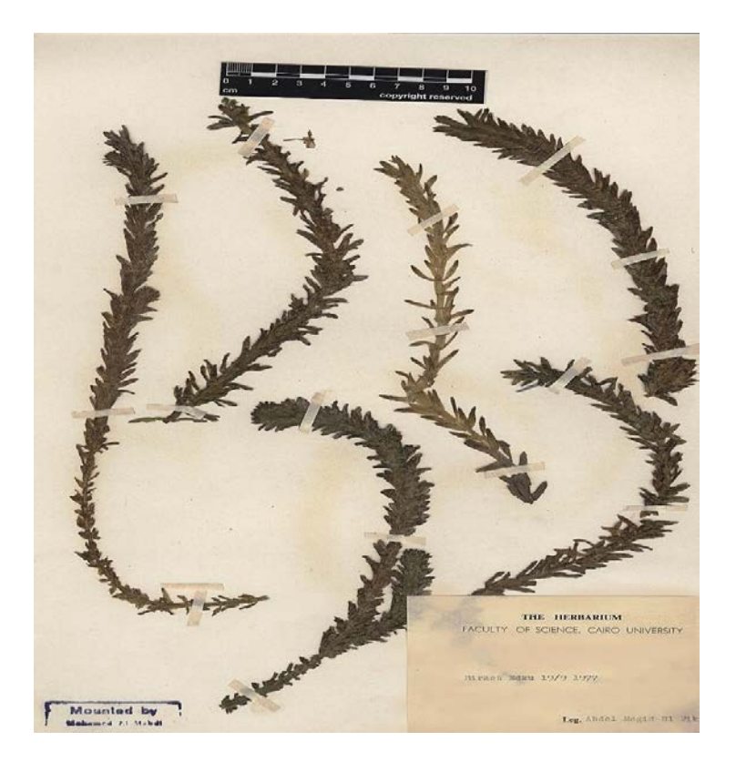
Fig. 1. Image of Herbarium specimen of Egeria densa (CAI)

Representative specimens. - Idku Lake, Nile Delta, 19.9.1977; A. Fiky s.n. (CAI)– Beheira Province, Idku, 19.8.1987, A. Amer 12743 (CAI) -Faculty of Science Garden, Alexandria, 1.6.1975; A. Gazzar s.n. (CAI)-Giza; 10.4.1931; E. Greiss s.n. (CAI) - Giza, Faculty of Science garden, 14.3.1936; A. Soliman s.n. (CAI).