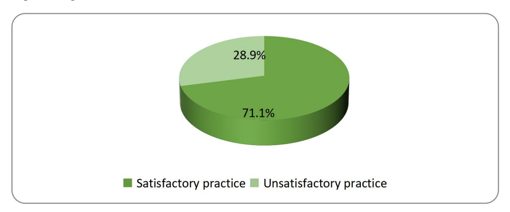
Figure (3): Percentage distribution of the studied mothers according to their total reported practices toward home environmental safety and prevention of poisoning for their children under 5 years old.