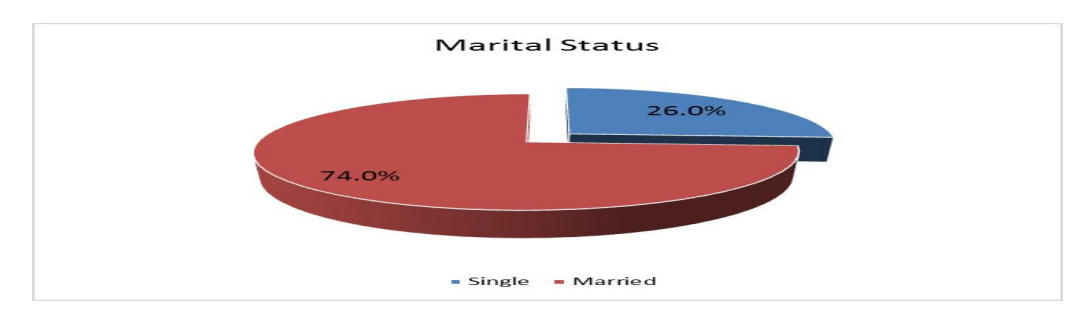
Figure (2): Percentage distribution of the studied patients according to their marital status (N=50).