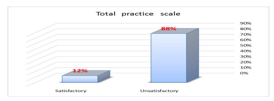
Figure (4): Percentage distribution of the studied patients according to their total self-care practice level (N=50).