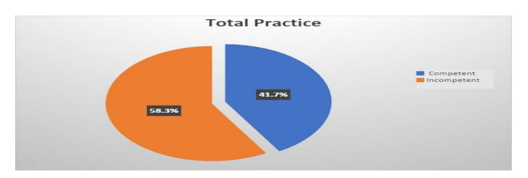
Figure (2): Percentage Distribution of Studied Nurses' Total Practice toward infection control measures for mechanically ventilated patients (N=60).