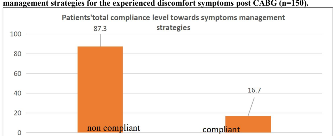
Figure (2): Percentage distribution of patients total compliance level toward management strategies for the experienced discomfort symptoms post CABG (n=150).

Table (5): Relation between total level of the experienced discomfort symptoms post CABG and demographic characteristics among the studied patients (n=150).