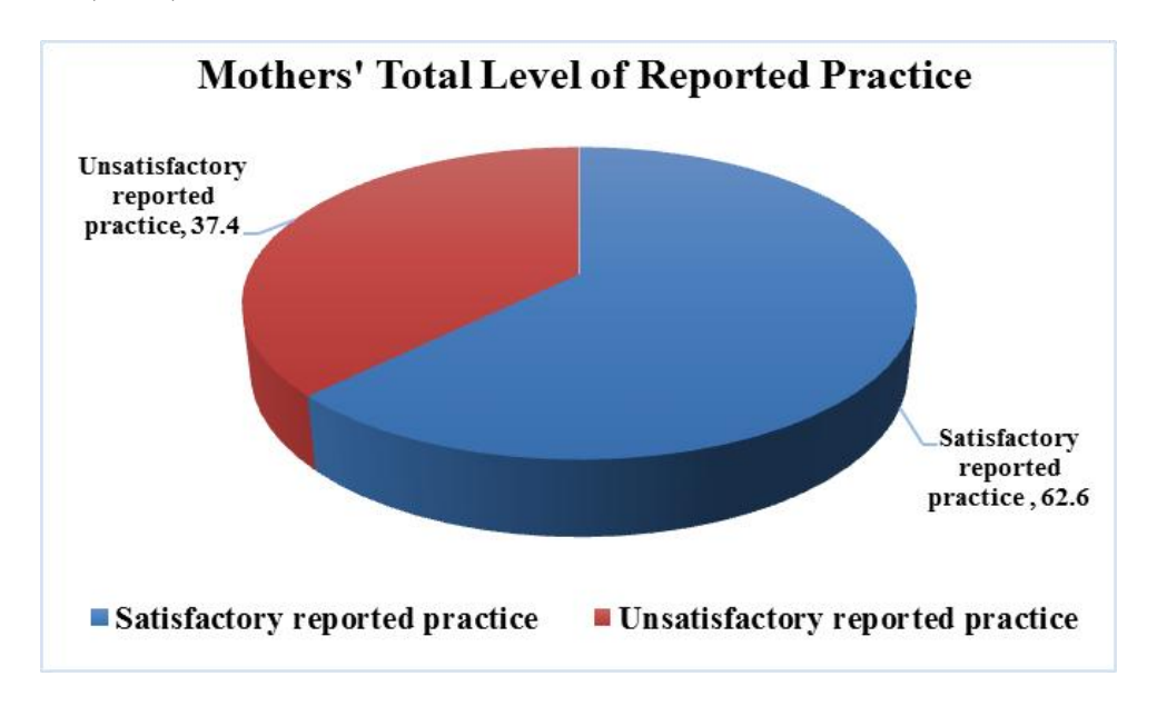
Figure (2): Percentage distribution of studied mothers' total level of reported practices (n= 409).