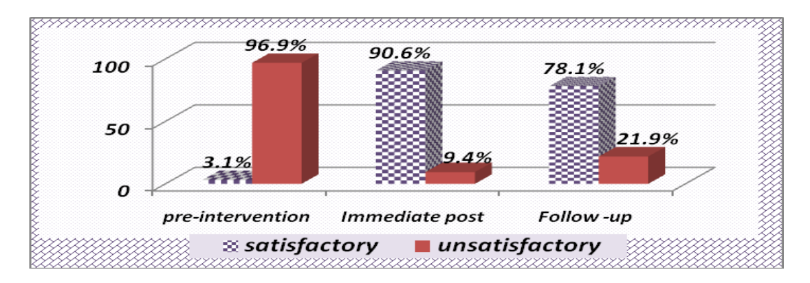
Fig. (1): Percentage distribution of studied nurses' total knowledge score regarding electrocardiography at different phases of program implementation.