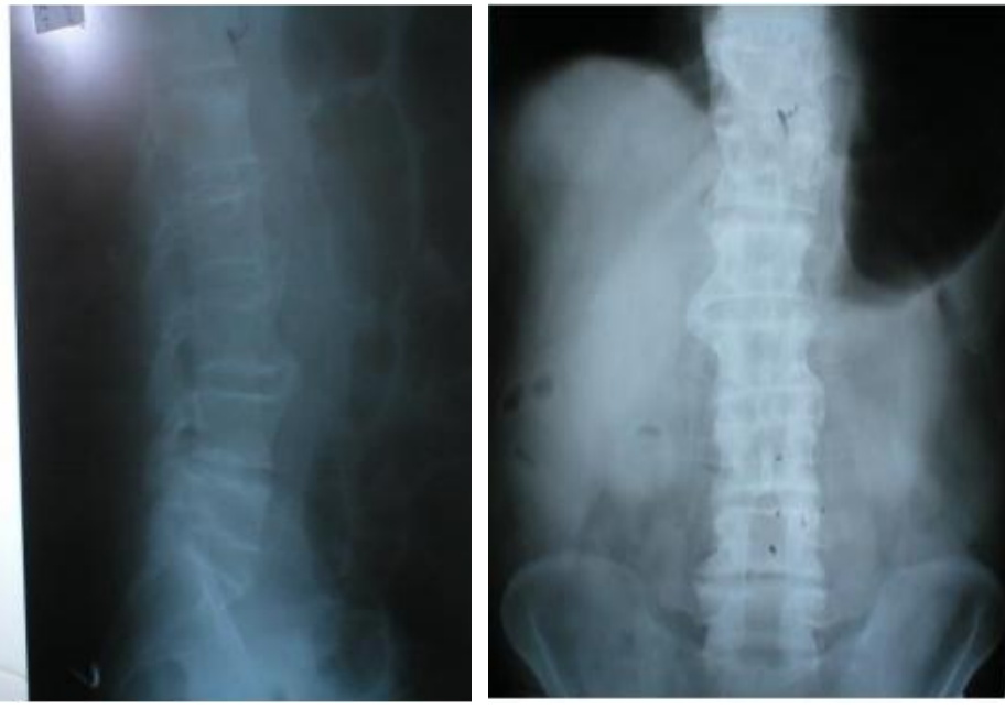
Fig 3: X-ray lumbar spine shows extensive spondylosis.