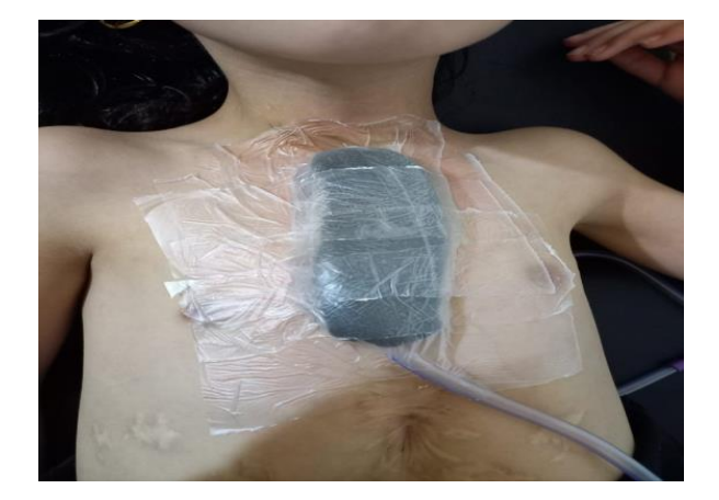
Figure (1): Showing polyurethane foam trimmed according to wound geometry and connected to evacuation tube to VAC device.

The VAC dressing usually changed every 2-4 days with average 3 days. The porous polyurethane foam allowing an equal distribution of the sub atmospheric pressure to whole wound surface with progressive reduction of the wound size and progressive formation of granulation tissue with time.