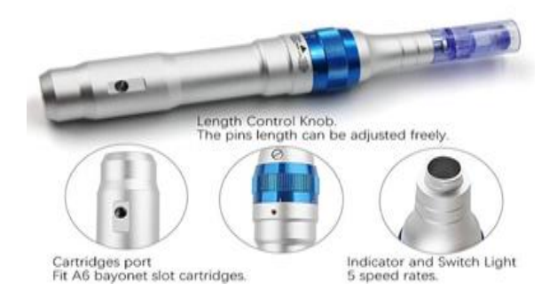
Figure (1): Wireless electric derma pen (1).