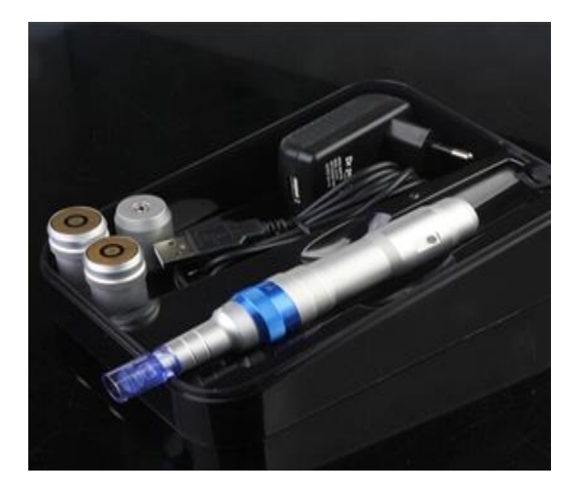
Rechargeable Electric Micro Needle System

Acne atrophic scarring is typically treated with microneedling, which is performed in an office setting. Its clinical utility has been repeatedly demonstrated. In most cases, a series of 3-5 therapy sessions spaced out every 2–4 weeks will result in an improvement of 50%–70%. Microneedling has been compared to chemical peels, cryorolling, and carbon dioxide laser therapy for the treatment of acne scars, and these treatments are often used together for optimal results <sup>(1)</sup>.