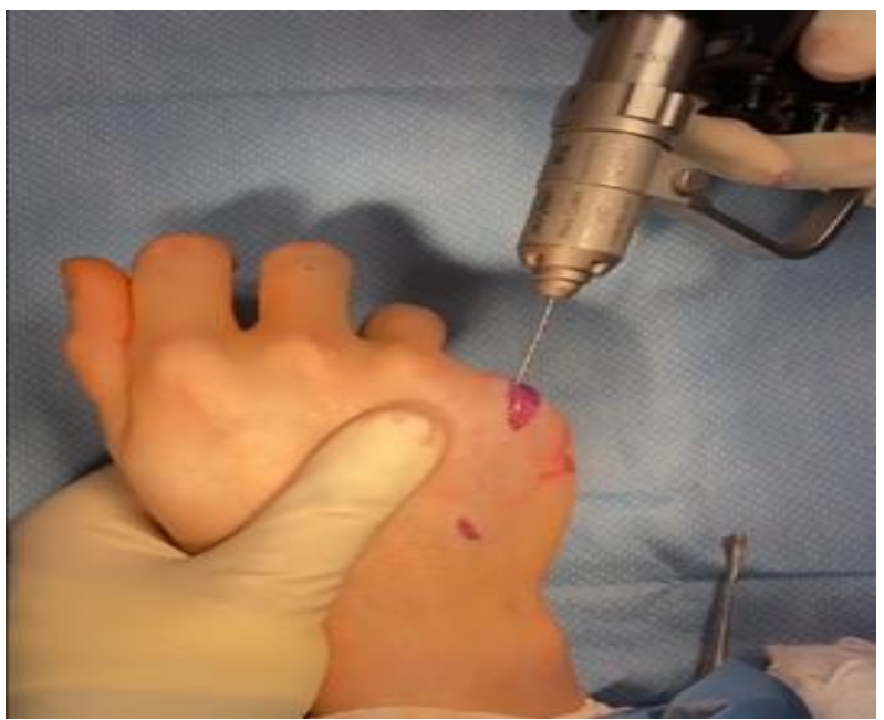
Figure (2) Guidewire placed along dorsal 1/3 and full length of metacarpal