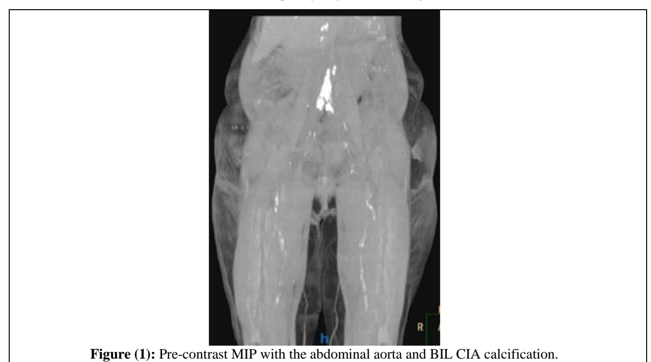
COLLATE RALS - COLLATE RALS