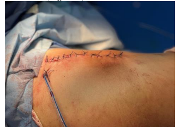
Figure (4): After emptying the incision, the wound is closed in layers.

Suction draining the wound followed by layering the wound's closure (Figure 4).