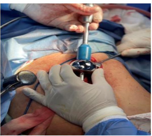
Figure (2): The definite head is applied.

8) Using the tension band approach, two wires were tied anteroposterior above the greater trochanter, and subsequently wires were tied anteroposteriorly and laterally below the lesser trochanter. Over the trochanteric region, these wires were attached.