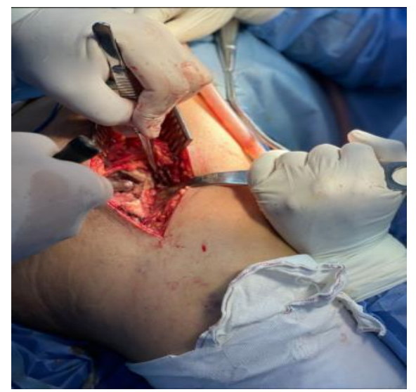
Figure (1): The standard corkscrew can be used to remove the head and neck.

A split was made in the abductor component of the gluteus medius anteriorly along its fibres, which left a large piece of this muscle linked to the greater trochanter. No more than 3-4 cm of the greater trochanter were cut to prevent causing harm to the superior gluteal nerve, which exites the lower back and travels through the greater sciatic notch to pass under the gluteus medius muscle. A transverse path running 1 to 5 centimetres in height above the muscle's greater trochanter was made. Electrocautery release of the gluteus medius' distal end from the greater trochanter's anterior border was done. Pealing the upper part of the vastus lateralis muscle off the proximal femur was done for better exposure of proximal femur for reconstruction. Anterior flap that consists of the anterior part of the gluteus medius was developed and the gluteus minimus was cut off the greater trochanter using electrocautery. The anterior capsule was exposed then capsule was split by longitudinal T shaped incision. It was necessary to remove the head and neck when proper femur exposure was achieved with the corkscrew (Figure 1).