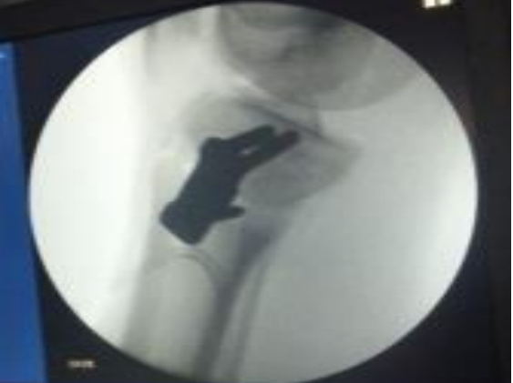
Fig. (3): Fixation by Puddu plate.