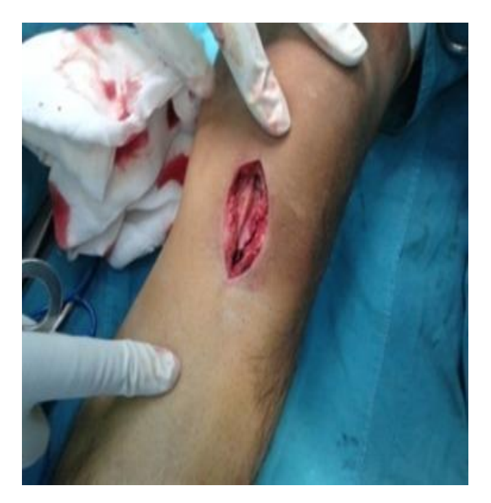
Fig. (1): Showing skin incision and exposure for HTO.

K-wires (three millimeters in diameter) were advanced medially up to the lateral cortex and parallel to the joint line to maintain the original tibial slope as well as to prevent the fracture from progressing further into the tibial condyles. After that, a second K-wire (2.4 mm in diameter) was inserted into the lateral cortex at an acceptable angle.