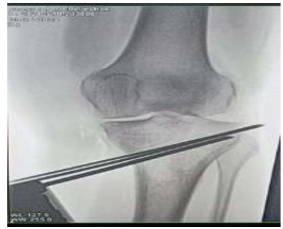
Fig. (2): Using the osteotomy saw in osteotomy

An osteotomy of the lower part of the tibial tuberosity was performed to prevent its fracture during the tibial osteotomy. Osteotomy was performed with oscillating saw blade parallel to guiding pin to avoid intra-articular fracture. Specifically, the saw was used to sever the medial cortex of the patient in this case.