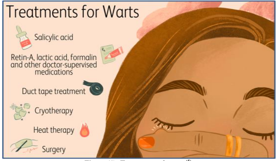
Figure (1): Treatments of warts <sup>(5)</sup>.