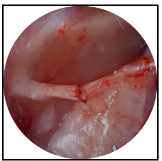
Fig. (3): Left side sciatic nerve after good repair

The wound was closed in layers Vicryl 4/0 for the muscle and prolene 4/0 for the skin in all rats and the skin was painted with povidone iodine 10 %. A surgical microscope and dissecting lenses were used to facilitate and properly perform dissection and reanastomosis of the nerves in all rats.