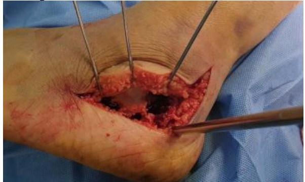
Figure (2): Steinmann pin insersion for traction.

Steinmann pin was inserted (under fluoroscopy guide) from lateral to medial in the inferior part of the posterior of the calcaneus. Reduction is started from medial to lateral then from posterior to anterior and by the tuberosity fragment, then restoration of calcaneal height and length with valgus and varus alignment is done (figure 2).