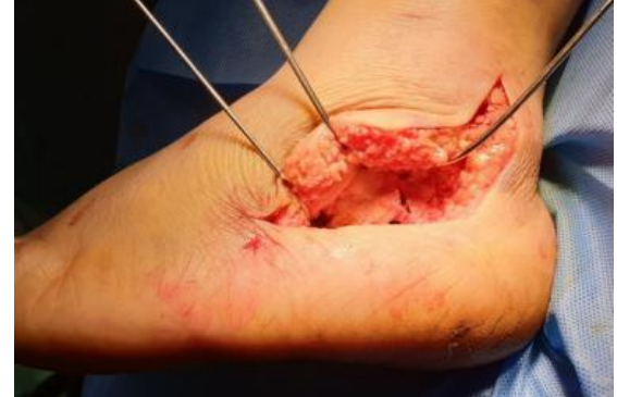
Figure (1): Full-thickness flap non-touch technique.

All patients were operated on spinal anesthesia (15 patients), except in the patients with associated spine injury (3 patients) where general anesthesia was used. A pneumatic thigh tourniquet was used up 300mmHg with pre squeeze to the limb with setting the time of application of the tourniquet. Antibiotic (3rd generation cephalosporin) is given before the application of tourniquet by 30 minutes. Kirschner wires were inserted to hold the skin flap back and perform a non-touch technique, the 3 K wires placed on the fibula, talus, and cuboid bone (Figure 1).