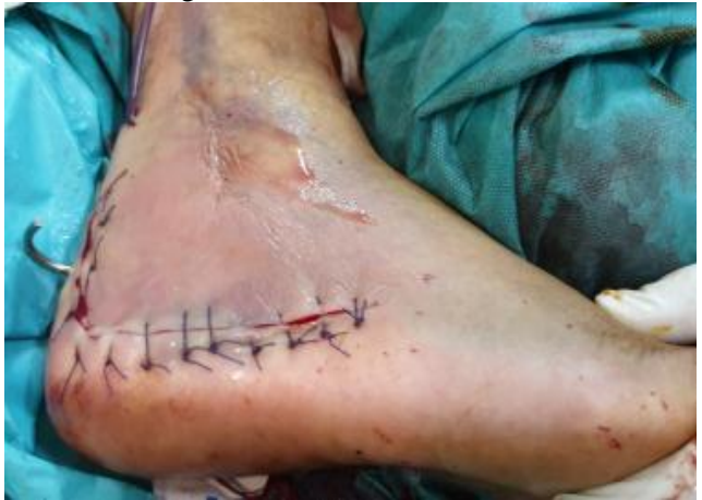
Figure (4): Closure and drainage.

There was no need for the use of bone graft in all cases. Irrigation and proper hemostasis were done and closure was done in a layered fashion with absorbable suture vicryl (2-0), and a drainage tube is also used (Figure 4).