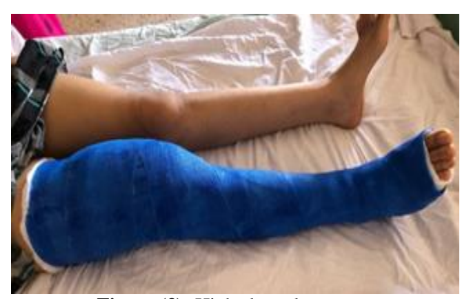
Figure (3): High above knee cast.

Plate position was then verified with AP and lateral fluoroscopy. vacuum drain was inserted and closure of the vastus medialis was fastened back to medial septum with interrupted sutures. The subcutaneous tissue and skin were closed in routine fashion, and compression dressing was applied. High cast above knee was applied in all patients (Figure 3).