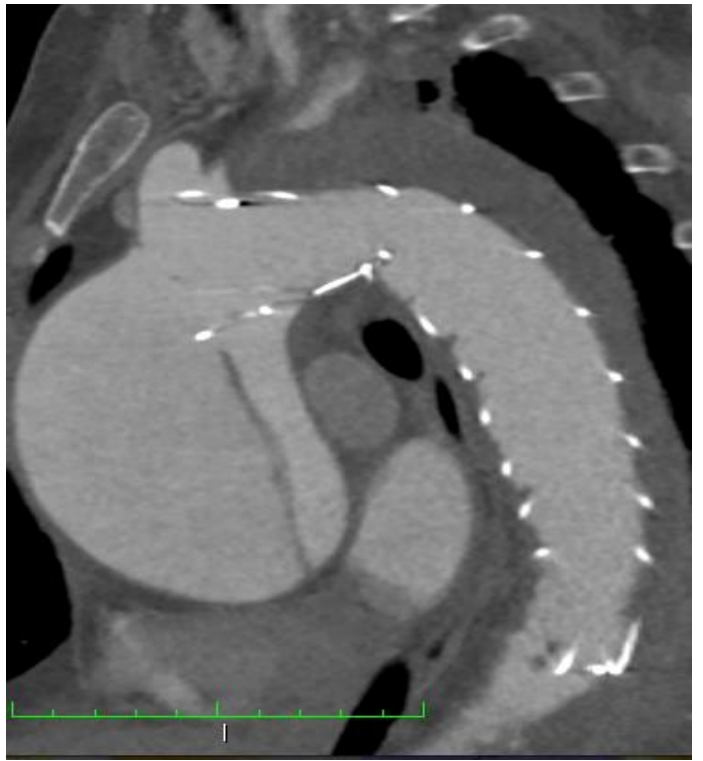
Figure (1): CT aortography showing Stanford type A aortic dissection with a previously deployed endovascular stent distally

previously deployed stent with subsequent occurrence of type A aortic dissection.