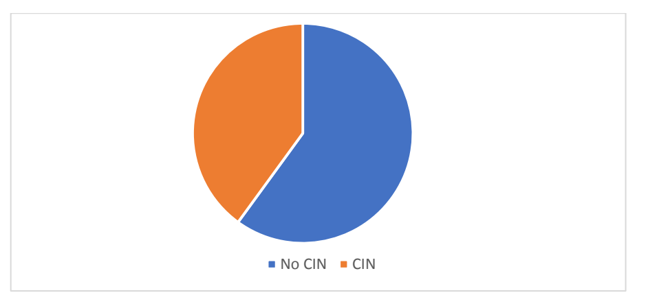
Fig (1): Pie chart for incidence of contrast-induced nephropathy in our study 40% (n = 16) of patients developed contrast-induced nephropathy post coronary angiography while 60% (n = 24) did not fit the definition of CIN (Figure 1).