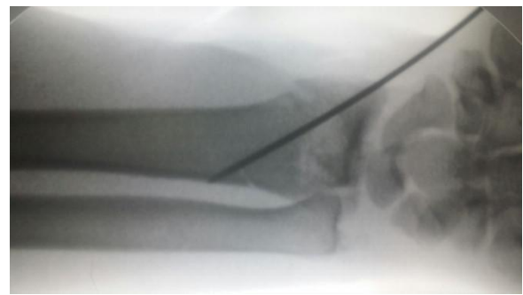
Figure (3): preliminary fixation of large articular fragments.

After exposure and debridement of the fracture site, the fracture was reduced and provisionally fixed under C-Arm using k-wires. Extra-articular fractures were reduced by simple traction and slight palmar flexion of the wrist and manual manipulation. In intraarticular fractures, large fragments were being manipulated, reduced and preliminary fixed by wires (Figure 3).