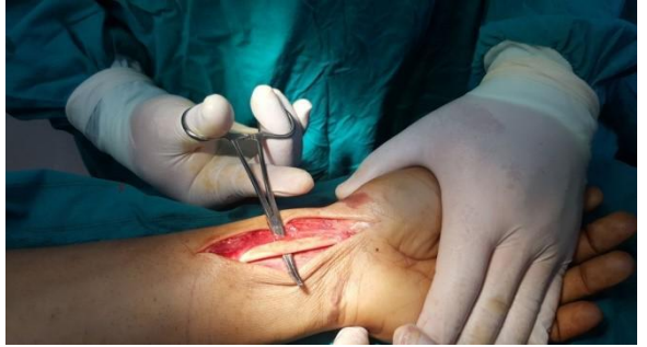
Figure (1): Flexor carpi radialis tendon after sheath release

The pronator quadratus muscle and the anterior wrist capsule are then exposed after blunt dissection and then are mobilized by releasing its distal and lateral borders with an L-shaped incision (Figure 2). It is then lifted from its bed by subperiosteal dissection, exposing the fracture site.