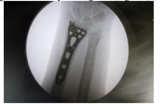
Figure (5): Distal screws catch small radial styloid fragment.

The distal fixation of the plate was finished by the insertion of lateral screws. If sufficient angulation of the screws relative to the longitudinal axis of the plate can be achieved, one or two screws were directed from the volar radial aspect of the plate in a dorsal and radial direction. This stabilizes the radial column. The direction and the size of 2.4 of the screws allow catching small radial styloid fragment (Figure 5).