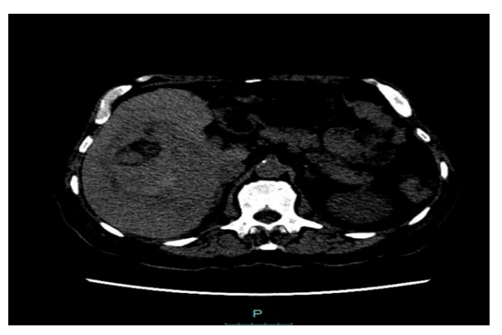
Figure 1 a

The presence of atypical enhancement patterns in well-differentiated HCCs as well as poorly differentiated HCCs using CT, ultrasonography, and MRI, is not an unusual finding. Asavama et al (28) studied the appearance of 60 HCCs on the CT arterial phase and stated that the arterial supply was reduced in the advance HCC as it progressed from MD HCC to PD HCCs. Another study confirmed that the arterial enhancement usually increased from WD to MD HCCs, while there was a reduction of arterial enhancement as the lesion transformed from MD to PD HCCs. Interestingly, among the three types, PD HCCs were the commonest to show hypo-enhancement during the arterial phase. Intratumoral arterial growth was mostly seen in advanced HCCs, namely PD (65%) and MD HCCs (64%) (Fig 1). Tumor necrosis on CT was rarely seen WD HCCs where it was more commonly seen with advanced HCCs (MD and PD). This finding is consistent with the fact that WD HCCs are composed of well-organized hepatocytes and form trabeculae, cords, and nests, while PD HCCs have pleomorphic, anaplastic and giant cells with central necrosis due to poor vascularization ^{(6)} .