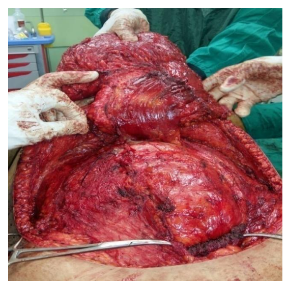
Figure (1): Transverse rectus abdominis myocutaneous flap.

Staging of the tumor was done in addition to assessment of hormonal receptors status (ER/PR), HER-2, tumor size, tumor characteristics, lymph nodal status and histological grading.