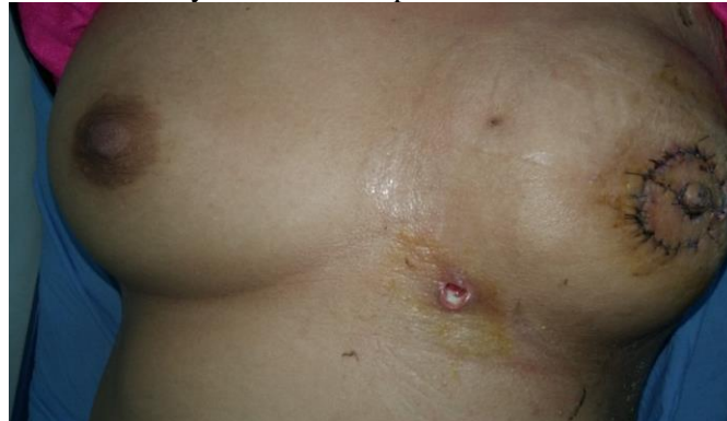
Figure (2): Extended LD flap reconstruction.