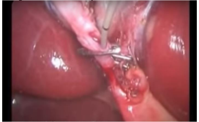
Fig. (3): Cannulation of cystic duct

Follow-up was done clinically and by serum bilirubin (total & direct) with abdominal U/S for one year. All data were collected and analyzed as regard perioperative details and clinical outcomes.