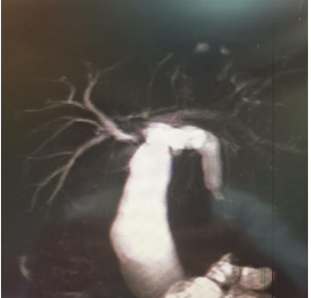
Fig. (1): preoperative cholangiogram showing dilated CBD, distal end CBD filling defect (stone) and minimal intrahepatic biliary dilation.

The patients with high suspicion to choledocholithiasis according to previous criteria received a preoperative MRCP ( fig. 1 ) which were interpreted by single radiologist then scheduled for laparoscopic cholecystectomy and undergone Intraoperative cholangiography (IOC) with subsequent cholecystectomy.