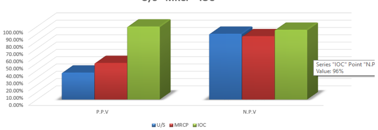
POSITIVE AND NEGATIVE PREDICTIVE VALUES OF U/S - MRCP - IOC

Fig (6): results of U/S, MRCP, IOC in the study