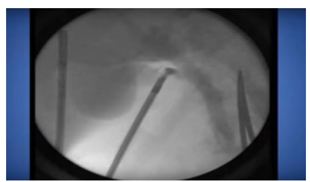
Fig. (4) & (5): images of intraoperative cholangiogram showing dilated biliary tree.