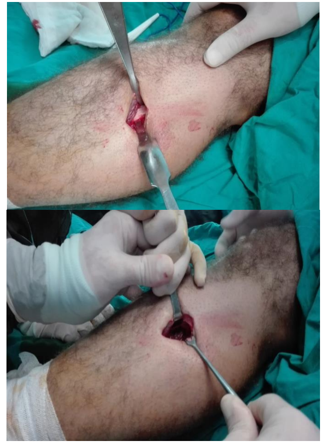
Figure 1 the fibular segment before and after osteotomyFree mobilization and weight bearing were allowed postoperatively. Knee pain was assessed using a visual analogue scale (VAS). Knee ambulation activities were recorded using the knee and function subscores of the American Knee Society score (KSS) preoperatively and postoperatively.

muscles were separated, and the fibula was exposed. A 2cm section of the fibula was cut 6 to 10 cm below the fibular head with the use of a saw. After resection, irrigation with a normal saline, the muscles, fascia, and skin were sutured separately ^{(7)} .