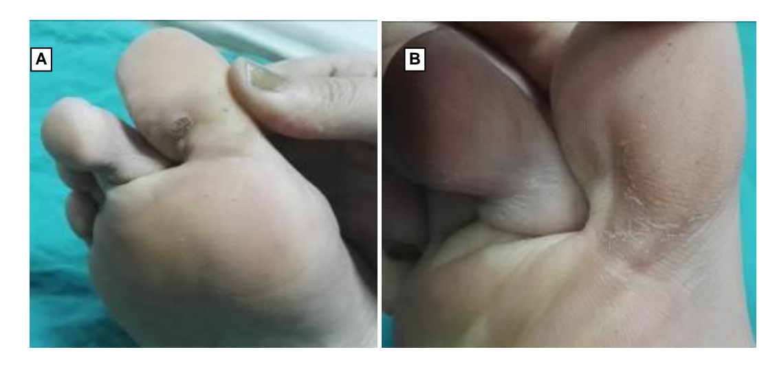
Figure (5): Female patient, 25 years old, with a single planter wart of 5 months duration showed complete response after 6 sessions of saline injection. (A) Before treatment. (B) After treatment.