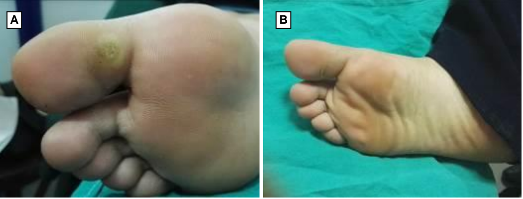
Figure (3): Female patient, 22 years old, with a single planter wart of 10 months duration showed complete response 6 sessions of saline injection. (A) Before treatment. (B) After treatment.