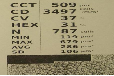
Fig. (10): preoperative specular microscope of 45 years old hyperopic patient.