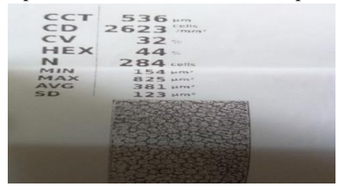
Fig. (7): preoperative specular microscope of 42 years old myopic patient.

Figures (7, 8, and 9) show endothelial counts of myopic patient who had RLE procedure with phaco-aspiration (preoperative and one and six months postoperatively)