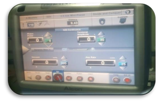
Fig. (2): Phaco-dynamics of Infiniti Alcon machine.

After the operation all patients received the same standard medication for 4 weeks, consisting of 15 mg prednisolone acetate ophthalmic suspension 1% five times/day with gradual tapering over one month, gatifloxacin eye drops five times daily for one month and tobramycin 0.3% dexamethasone 0.1% eye ointment at bed time for one month.