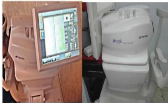
Fig.(1) :Specular microscopy (Topcon SP- 1P, Topcon Medical Inc., Japan), Azhar University Hospitals.

Before surgery, pupillary dilatation was achieved by 1% tropicamide and 1% cyclopentolate eye drops.