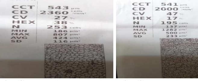
specular microscope of same patient in previous figure.