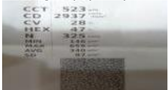
Fig. (11): one month postoperative specular microscope of the same patient in the previous figure