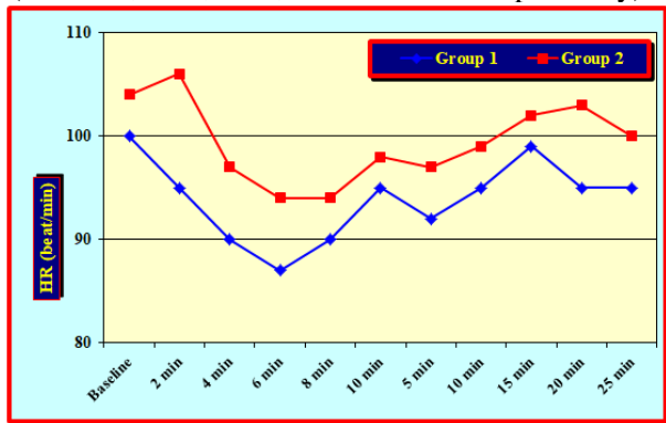
Figure (4): Demonstrates comparison between the two studied groups as regarding heart rate

There was no significant change in heart rate in both group (1) and group (2) when measured at admission (baseline), before delivery at 4 min, 6 min, 8 min and 10 min (P = 0.19, 0.10, 0.12, 0.44 and 0.77 respectively) while measurement of mean heart rate 2 min showed a significant increase in heart rate of patients of group (2) than in those of group (1) (P = 0.010) and after delivery at 5 min, 10 min, 15 min 20 min and 25 min there was no significant change in heart rate (P = 0.13, 0.26, 0.32, 0.10 and 0.33 respectively).