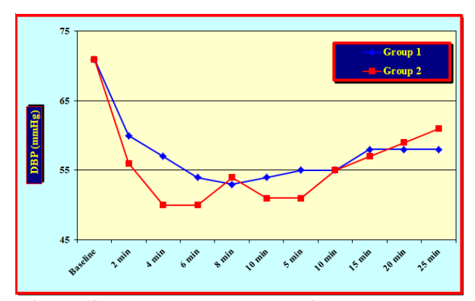
Figure (2): Demonstrates comparison between the two studied groups as regarding DBP.

There was no significant change in DBP group (1) and group (2) when measured at admission (basline), before delivery at 2 min, 6 min, 8 min and 10 min (P = 0.83, 0.33, 0.18, 0.97 and 0.72 respectively) while measurement of DBP at 4 min showed a significant reduction in group (2) than in group (1) (P = 0.02) and after delivery at 5 min, 10 min, 15 min 20 min and 25 min there was no significant change in DBP (P = 0.11, 0.89, 0.57, 0.72 and 0.62 respectively).