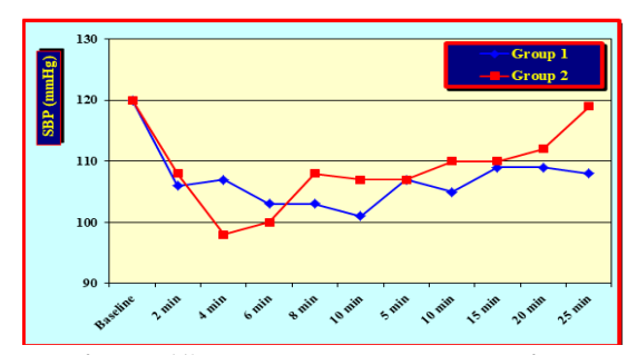
Figure (1): Demonstrates comparison between the two studied groups as regarding SBP.

There was no significant change in SBP in group (1) and group (2) when measured at admission (baseline), before delivery at 2 min, 6 min, 8 min and 10 min (P = 0.67, 0.83, 0.34, 0.55 and 0.51 respectively) while measurement of SBP at 4 min showed a significant reduction in group (2) than in group (1) (P = 0.02) and after delivery at 5 min, 10 min, 15 min 20 min and 25 min there was no significant change in SBP (P = 0.95, 0.13, 0.86, 0.43 and 0.06 respectively).