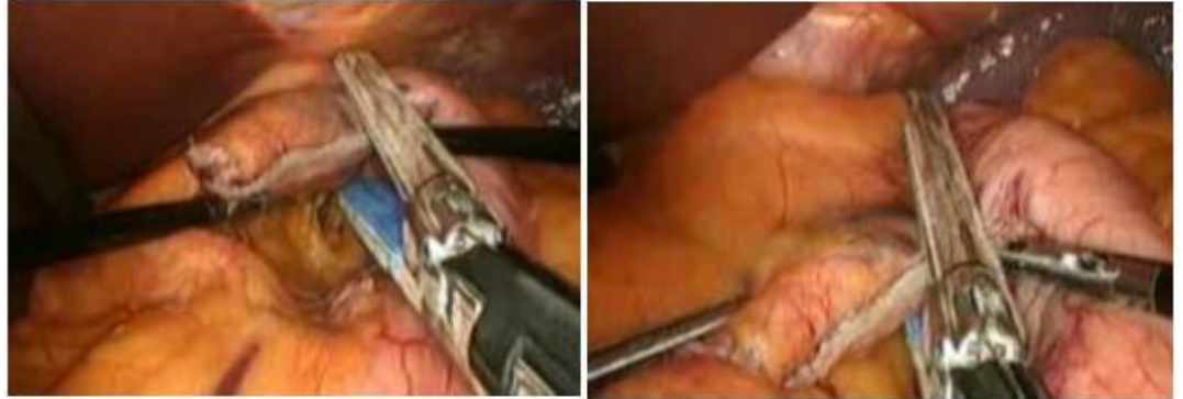
Figure 3: In LMGB sequential application of application of five to six 60-mm linear staplers (Blue load staplers 3.5 mm).