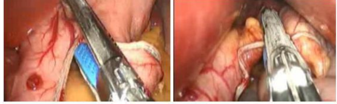
Figure 2: In LSG; sequential application of five to six 60-mm linear staplers (Blue load staplers 3.5 mm).