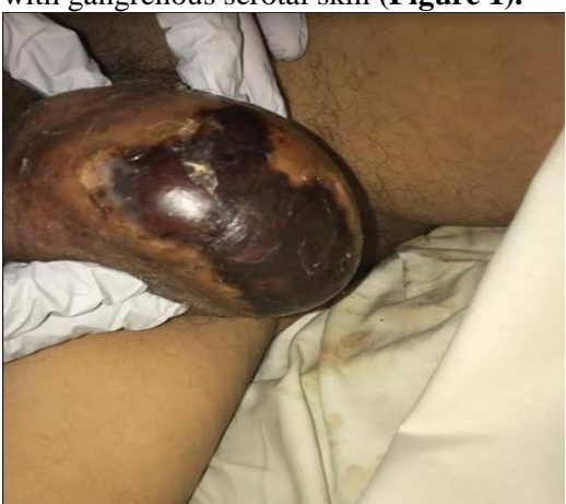
Figure 1: picture of the scrotum that shows marked swelling with a large area of gangrenous skin

had a fever of 39.5C, pulse rate of 112 and blood pressure of 103/65. He appeared fatigued and dehydrated. Abdominal examination revealed generalized abdominal distention and tender swelling over the left inguinal area. Genital examination showed swollen scrotum with gangrenous scrotal skin ( Figure 1 ).