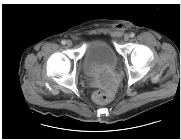
Figure 2: an axial cut of the CT scan following groin and left testicular abscess drainage. There is multi-lobular rim enhancing fluid collections in the left prostate and left seminal vesicle

Ultrasound showed left scrotal abscess, an intact testis, left groin collection and possible incarcerated hernia. Due to patient's high creatinine, a non-enhanced CT scan of the pelvis was performed, which revealed as a small bowel-containing left direct inguinal hernia, with no bowel obstruction. The patient was started on empirical antibiotics and underwent an emergency incision and drainage of the scrotal abscess with debridement of Fournier's gangrene. The procedure also included exploration and repair of left inguinal hernia revealing an inguinal abscess involving the spermatic cord that was drained. In addition, we elected to further assess the extent of the inguinal abscess. Therefore, an enhanced CT scan of the pelvis was performed after the renal function has normalized. The CT scan showed a large seminal vesicle and prostatic abscess (Figure 2), which was drained transurethrally.