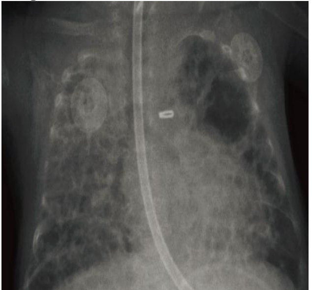
Figure 1: Chest radiograph of infant with bronchopulmonary dysplasia<sup>(1)</sup>.

Bronchopulmonary dysplasia (BPD) is pathological condition interchangeably used with chronic lung disease (CLD) that develops in preterm neonates treated with oxygen and positivepressure ventilation. The pathogenesis of this condition remains complex and poorly understood; however various factors can not only injure small airways but also interfere with alveolarization (alveolar septation). leading to alveolar simplification with a reduction in the overall surface area for gas exchange. The developing pulmonary microvasculature can also be injured <sup>(1)</sup>( Figure 1 ).