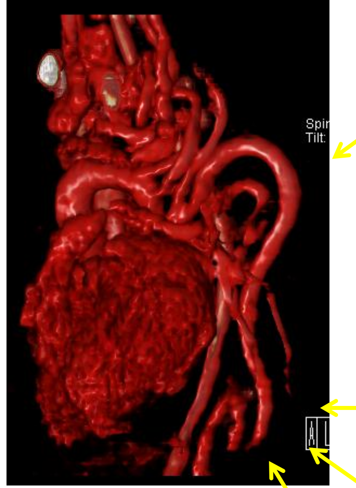
Fig. 1 b