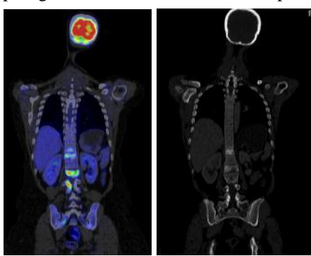
Fig (3): Coronal reformat of the PET CT fused images and corresponding CT images showing multiple osseous deposits T12 and L2 vertebral bodies Right ischium.