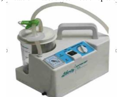
Figure (2): In our study, this modified set was used for negative pressure wound therapy.

application Figure (1) : A case of Diabetic foot infection up to skin grafting.