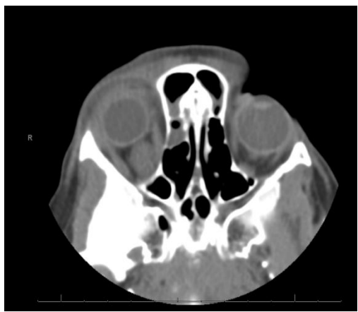
Figure 3: computed tomography scan of the brain and orbit showing presence of glioma.

Computed tomography (CT) scan of the brain and orbit was done ( Figure 3 ). The CT scan confirmed presence of optic nerve glioma (ONG). The fusiform enlargement of the right sided intra orbital part of optic nerve result in moderate right-side proptosis. Magnetic resonance imaging (MRI) was requested. The patient was referred to neurosurgeon for consultation further management.