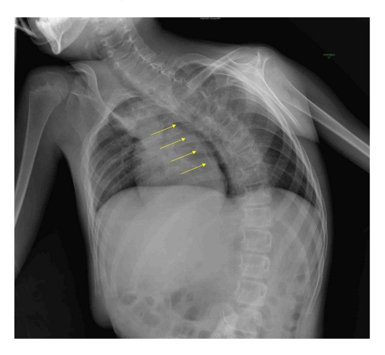
Figure 2a: Chest X-ray showing radiopaque elongated shape (yellow arrows) along the esophagus; measuring approximately 11 cm, with the proximal tip at T2 and the distal end at T9 level.