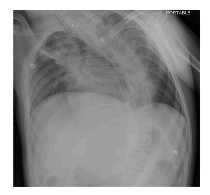
Figure 2b: Chest X-ray post-endoscopic removal of the NPA. Green arrow point to the ETT in place.