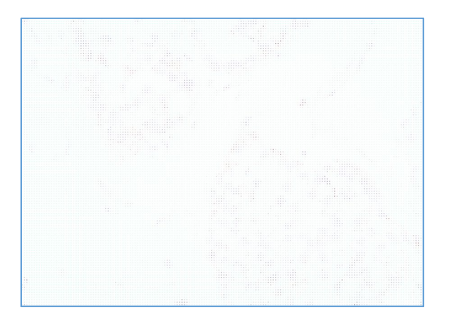
Figure 1: napsin A expression in ccRCC (left) showing weak granular cytoplasmic staining and intense staining in PRCC (right)

The relation between cyclin D1 expression and the nuclear grading of ccRCC and PRCC showed that 35% of cyclin D1 positive tumors were of grade I, 45% were of grade II, 15% were of grade III and 5% were of grade IV tumors. This correlation between cyclin D1 expression and nuclear grading was statistically insignificant (P value = 0.425).