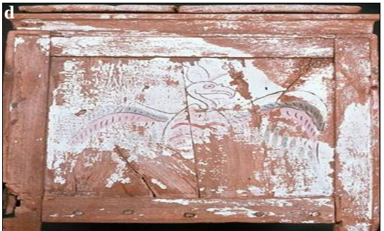
Figure (2) Showing a . one of the two long sides is decorated with the deceased on the funeral lion-shaped bed, and images of Isis, Nephthys and sons of Horus, b . the other side with the same previous theme, c . one of the narrow sides of the coffin represented the deceased lying on the lion-headed couch, d . the other narrow side has a depiction of a spreadwinged vulture.