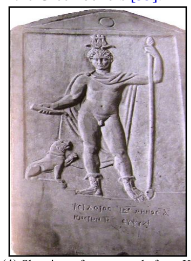
Figure (4) Showing a funerary stele from Kom Abu Billu of Isidoros ( after Grimm , 1975).

the most famous god of the underworld in the ancient Egyptian religion, was strongly syncretized and identified with Dionysus as a chthonic god. Herodotus also mentioned that the Egyptians celebrated the Dionysiac festivals, and the celebration of the Egyptians included almost all the features of the Greek celebration of Dionysus. He also considered that the worship of Dionysus came from Egypt [44]. Later Diodorus also identified Dionysus with Osiris [45]. In addition, the association between Osiris and Dionysus was very close and depended on other common factors; such as both deities were considered cosmic gods and both are deities of both fertility and vegetation [45]. Both of them are also wine gods [46]. The most common factor between Osiris and Dionysus is that they were killed and dismemberment. Osiris was killed by his brother Seth. Dionysus was also killed by the Titans [35], and then by the help of other gods, the bodies of both gods were reconstructed and at the end were resurrected [46]. The most important common denominator between myths of the two deities was also the process of laceration of the body that was done for both [36]. Plutarch idenified Osiris with Dionysus, and said clearly that Dionysus is no other than Osiris, and the rituals of the dismemberment are very similar. In addition, both gods were resurrected and re-born [47]. As a result, Dionysus was associated strongly with the underworld gods in the Greek beliefs [35].