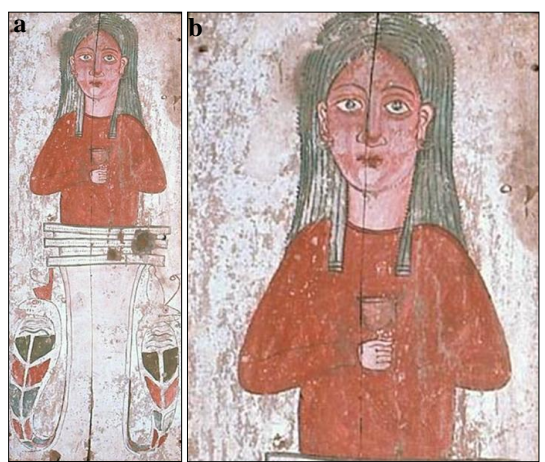
Figure (1) Showing a . the decorative scheme of the lid is the deceased emerging from a djed -pillar, b . details of the previous figure

eyebrows. The ears are small. The hair style can be traced back to the Egyptian wig-style, parted in the middle and has three locks falling freely down the back and in front of each shoulder, while revealing both ears. A vertical djed-pillar occupys the lower part of the lid, is depicted in Egyptian traditional design with a little exception. It has three not four horizontal bars as usual surmounting its top. The djedpillar is flanked by a pair of protective cowned cobras, back to back and looking at outside. The right-side cobra is crowned with the white crown and the other one with the red crown. The latter's body is divided into ten parts and the right-side one into only eight parts. All of the divisions are colored in red and black. The upper parts of their bodies are decorated with several wavy lines. The white djedpillar is bordered with two black outlines, representing the tails of the two cobras.