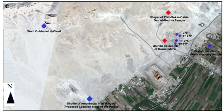
Figure (1) Shows <u>a.</u> proposal for start and end points of the main route of the Khoiak feast, without sub-routes, during the Ptolemaic Period (modified after Pm) [34], <u>b.</u> the points of the same main route features of the Khoiak feast ( Google Earth ), <u>c.</u> contexts of the Khoiak feast at Thebes context of the new kingdom context of the Ptolemaic Period ( Google Earth )