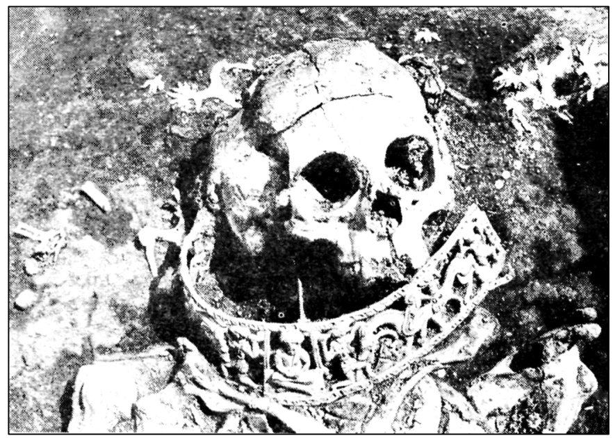
Figure (2) Shows burial in the mound 10, Kobyakov burial ground. (by Guguyev1992).

in the political life of the Bosporus. Thus, the Sarmatians were one of the important centers of power in the steppe zone of Eastern Europe, which was opposed by the Bosporus.