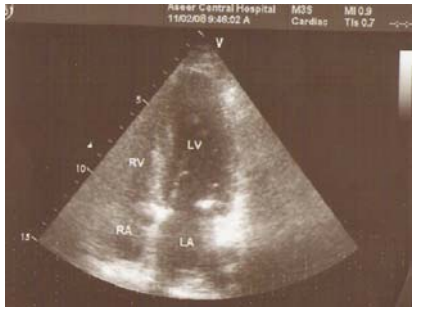
B- Apical 4 chambers view