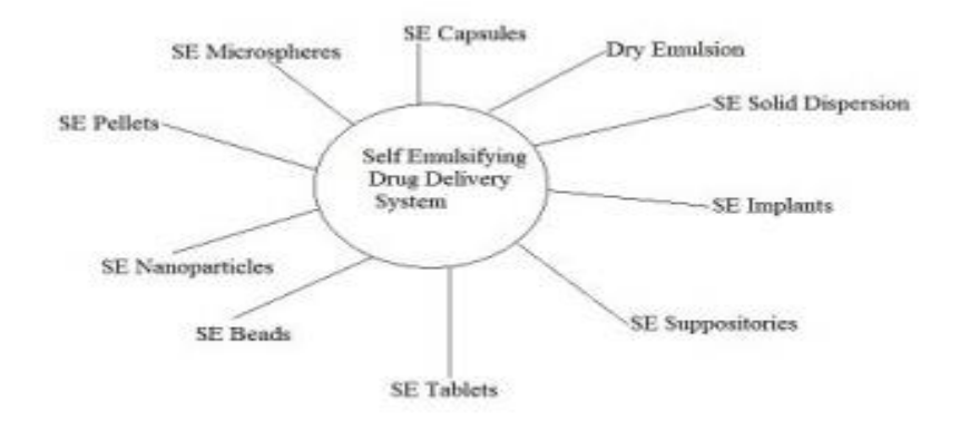
Figure 2: Various types of solid SEDDs

liquid self-emulsifying formula is filled into the soft or hard gelatin capsules for oral administration. The factor that governs the filling into capsule is the compatibility of formula filled with the capsule shell. An alternative method should be used if the formulation contains volatile oils as such components tend to leak through the capsule shell.