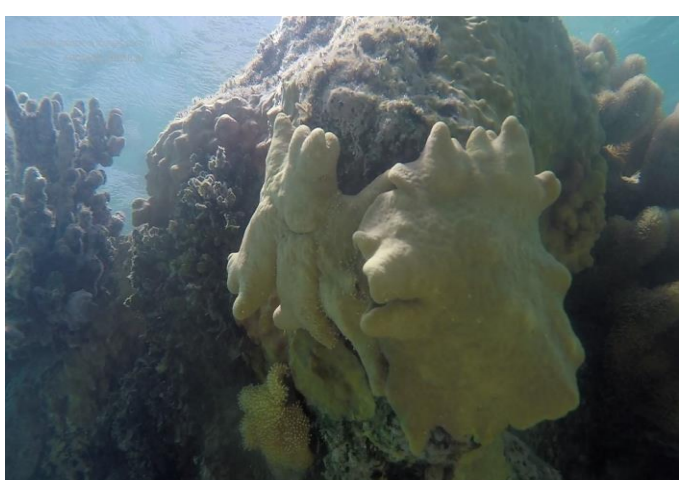
Figure1: Sarcophyton spongiosum photographed in its Red Sea habitat