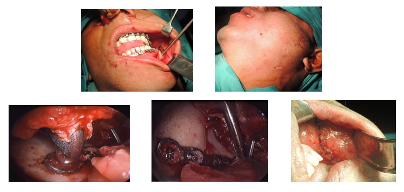
Figure (2): a; intra oral approach b; endoscopic port c; driver tightening a screw via trocar port d; maxi plate fixing condylar segment in place e; Intraoral wound after closure. (EAORIF group)