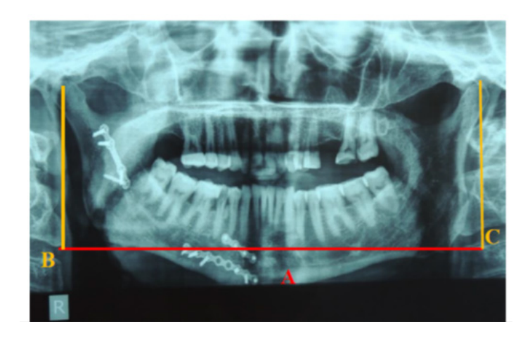
Figure(3) : Panoramic view showing how to measure ramus height. (A)Line denoting to horizontal reference line between the two gonial angle, (B) & (C) lines denoting the two perpendicular lines in the repaired and sound sides.