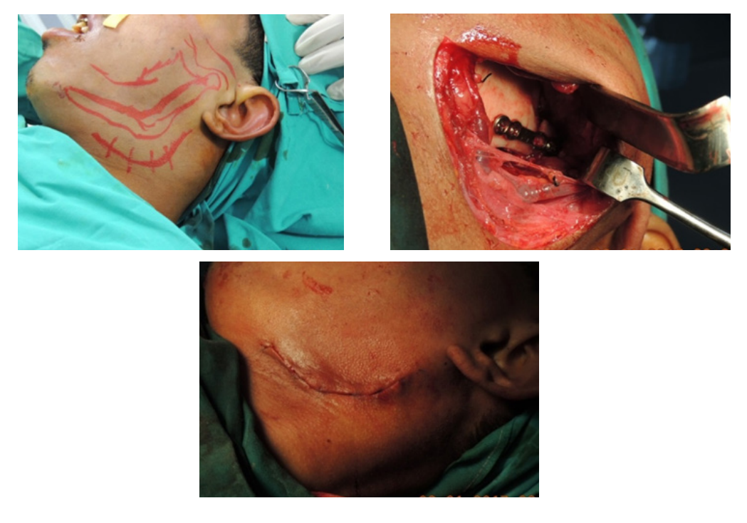
Figure (1): Retromandibular skin marking b; maxi plate fixed in place c; final skin closure (CORIF group)