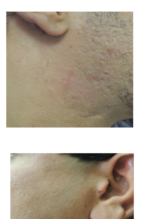
Figure (5): postoperative scars appearance at 6 month. a) CORIF group b) EAORIF group