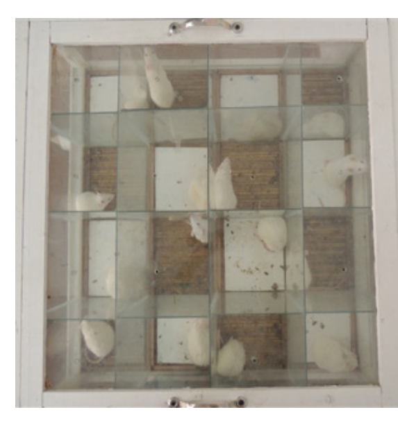
Figure 1: Communication box.

Psychological stress was induced by a communication box (CB) (Figure 1) which was proved to induce a psychological stress in rats and lead to biochemical changes in orofacial muscles and brux like activity in rats<sup>[20, 21]</sup>. CB is a glass box divided into 16 compartments which separated by transparent glass partitions to allow the rats to see each other without direct contact. Small holes were perforated in the glass partitions to allow proper ventilation. The ground of the box was constructed from a metal grid connected to electric generator to allow delivery of electric shock. Half of the cells ground were alternatively covered by wooden blocks in order to electrically isolate the ground and divide the box into electric conducting and non-electric conducting cells. When the FS group received electric shock, they screamed and jumped which subsequently induced indirect stress insult to the PS group by allowing them to visualize hear and smell the reaction of shocked rats. Electric shock was delivered via a generator with output voltage 48 V that produced intermittent electric shock every 2 sec for one hour daily for a period of one month.