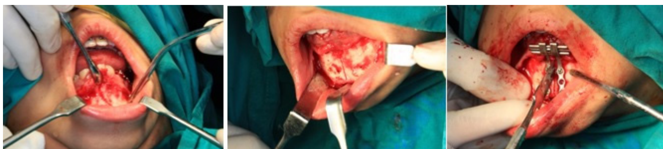
Figure 4: Showing the surgical osteotomy procedure for placement of the distractor.