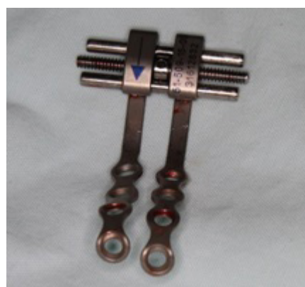
Figure 2: Rotterdam midline distractor.

Lateral cephalometric landmarks and measurements for assessment of the pharyngeal airway and hyoid bone position were as follows: (Figure 3).