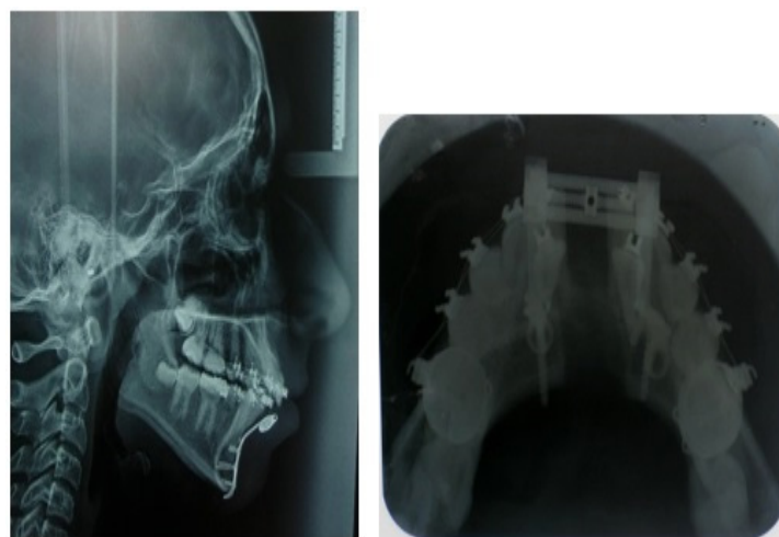
Figure 5: Lateral cephalometric radiograph and occlusal radiograph at the end of distraction.

A good clinical outcome was obtained in all subjects. Distraction was successful and the required amount of expansion was achieved with a mean bony distraction value of (10.43 mm). The distraction gap was symmetric (Figure 5). Widening of the lower arch was evident and elimination of the arch length discrepancy without the need for dental extraction was obtained (Figure 6). A good occlusal outcome was obtained and proper interdigitation was achieved with elimination of the posterior scissorbite. Overjet and overbite were significantly improved with a reduction of the overjet from 10 mm to 5 mm and correction of the overbite to around 30 % were attained.