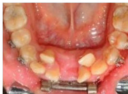
Figure 6: Clinical photograph showing the lower diastema at the end of distraction.