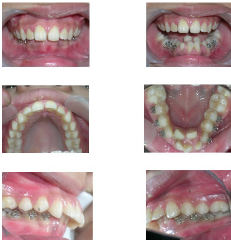
Figure 1: Showing pretreatment intraoral photos of a patient with bilateral posterior scissorbite.

This study was performed by analyzing the lateral cephalometric radiographs of 10 patients (7 females and 3 males) who underwent mandibular symphyseal distraction osteogenesis with a mean age 21.0 \pm 2.5 years obtained at T1 (before start of distraction) and at T2 (after symphyseal distraction). Patients included in the study had the following criteria: (Figure 1).