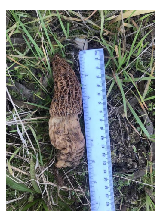
Fig 3. Morchella spp in Iraq © Shimal Abdul-Hadi.