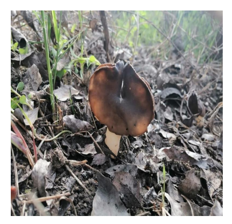
Fig 2. Helvella spp as a new record in Iraq © Shimal Abdul-Hadi.

Mohamed et al. 2021 Microbial Biosystems 6(1)-2021