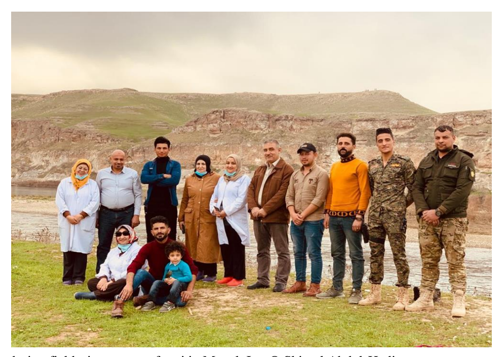
Fig 4. Iraqi team during field trip to assess fungi in Mousl, Iraq

Such changes in fungal conservation status in MENA will support the Fungal Red list Species on the Red List Initiative