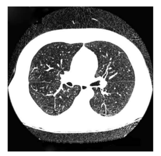
Figure (2) (a) after enhancement

• The enhancement doesn't increase the inherent information content of the data, but it increases the dynamic range of the chosen features so that they can be detected easily [12].